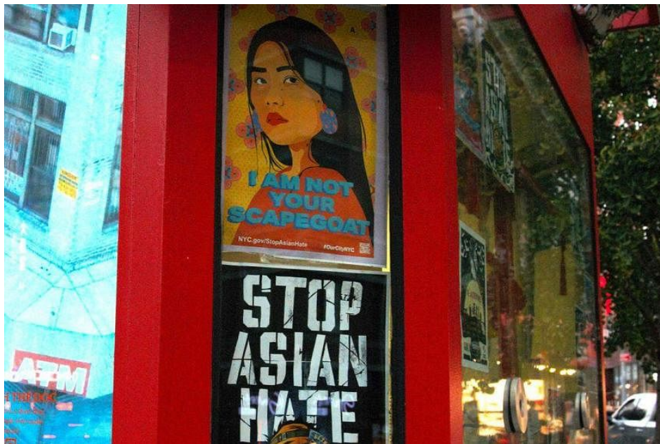
Posters in Chinatown, a reminder that it could happen again.

“Language that conflates Asians and Asian Americans with the Chinese government has been weaponised to mischaracterise and harm an entire race. Such ‘dog whistles’ perpetuate and escalate harm to Asian-American communities.”