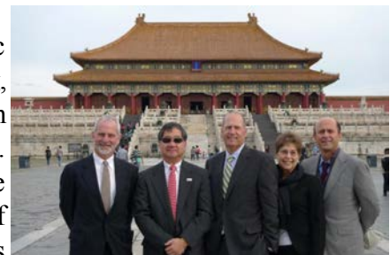
C-100 Civic Leader Delegates at the Forbidden City