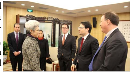
C-100's Journalist Delegation with Ambassador Fu Ying, Chairperson of the Foreign Affairs Committee of the National People's Congress

met with Chinese government, business, media, academic, and think tank leaders to discuss U.S.-China relations, China's economy, and China's socio-intellectual trends, among other topics. Journalists met with high-caliber government officials, including Ambassador Fu Ying, Chairperson of the Foreign Affairs Committee of the National People's Congress, and Zheng Zeguang, Assistant Minister of Foreign Affairs. Civic leaders delegates connected with Chinese counterparts: thought leaders, civil rights activists, and senior NGO management. Both delegations were impressed with local Chinese journalists who provided diverse perspectives on China. Delegates also met with C-100 members Mei-wei Cheng, Wei Sun Christianson, Handel Lee, Victor Fung, Timothy Tong, and Dazong Wang.