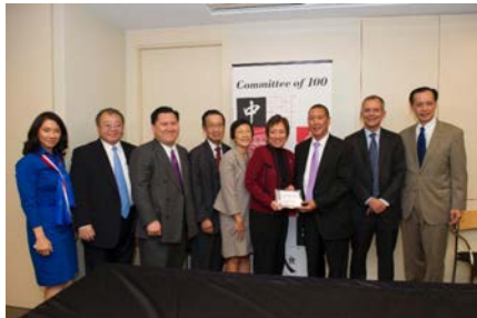
C-100 members and Executive Director with Forum Speakers