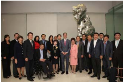
C-100 members with Los Angeles Mayor Eric Garcetti