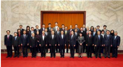
C-100 members with Premier Li Keqiang