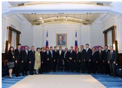
C-100 members with President Ma