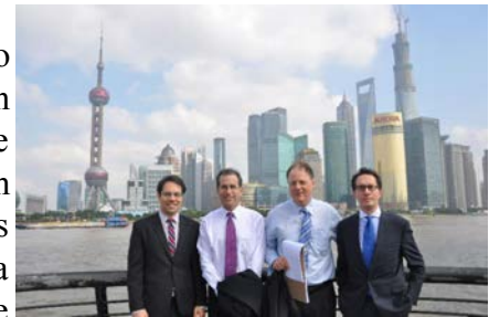
C-100's Journalist Delegation in Shanghai